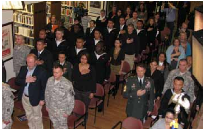
Naturalization ceremony at the Pritzker Military Library in Chicago, IL.

years and reported speaking a language other than English in the home.